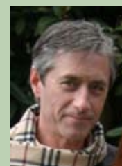
President & CEO